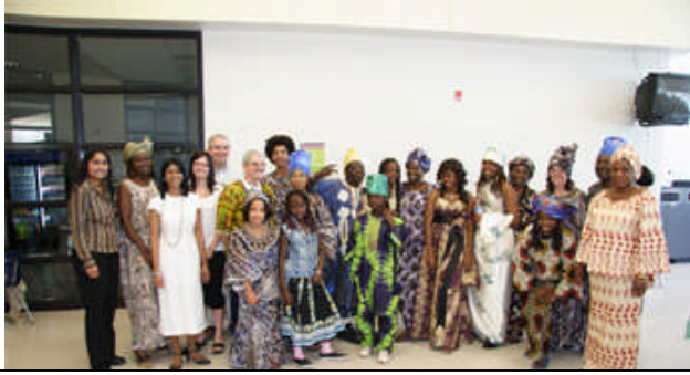
The African continent was well represented at the Cultures of North Bay event May 10. Members of the North Bay District Multicultural Centre staff joined them for this photo.